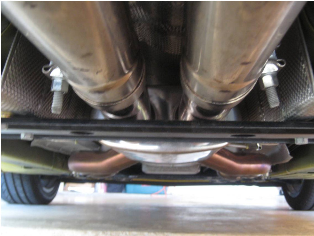
Picture of Stock Tunnel Brace