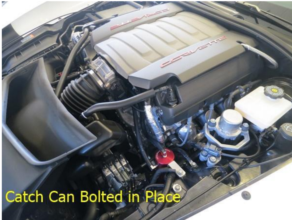
Catch Can Bolted in Place