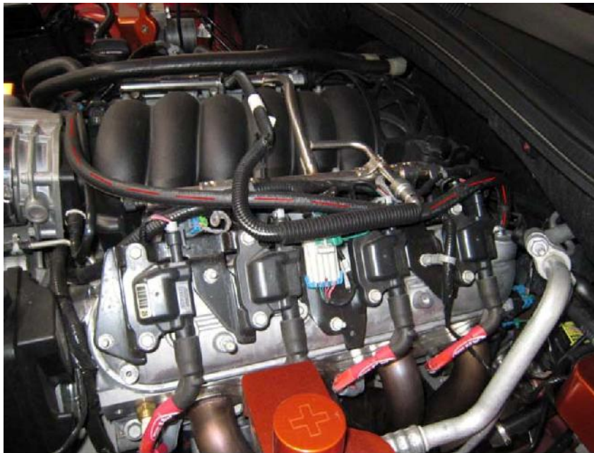
Figure 8: Hose Routing from PCV Outlet (Line Highlighted in Red for Clarity)