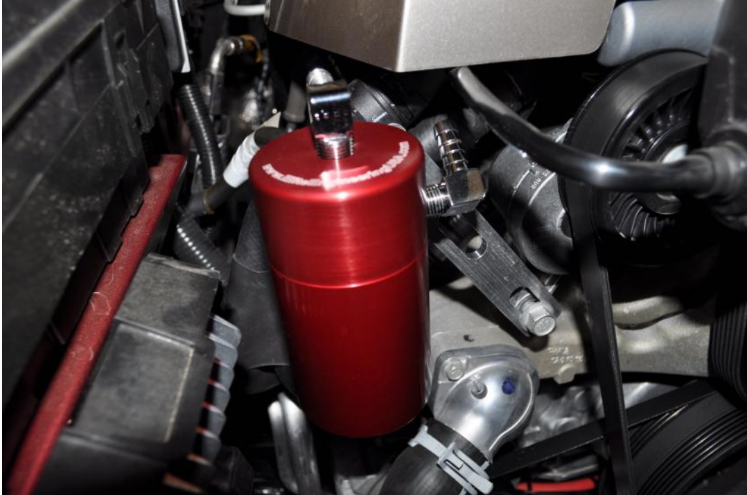
Figure 7: Catch Can Installed on Bracket