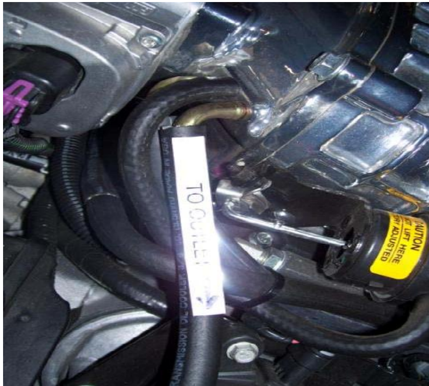
Figure 10: Supercharger Inlet Connection (Routes to Outlet on Catch Can)

For installation questions contact sales@EliteEngineeringUSA.com